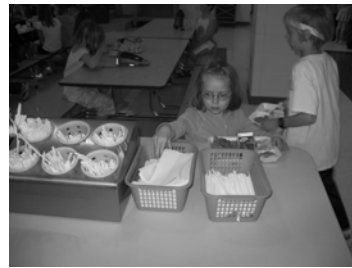
Condiments and utensils put on lowered table