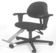
Ergo Chair for little people with adjustable height, back support, and foot support