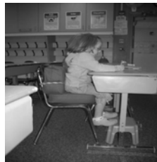
A home made cushion and stool