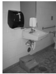
Stools in all public areas