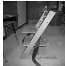
The Tripp Trapp Chair: an adjustable chair good for special classes like art and computers