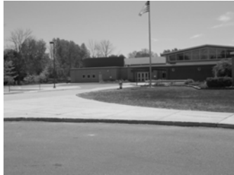
Drop off area