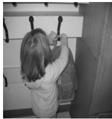
A lowered coat hook