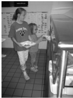
Trays are put on lowered shelf