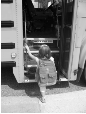
Getting on the bus