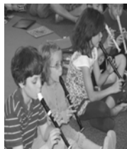
Alternative instruments may be needed in music