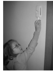
Light switch extenders