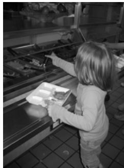
Salad bar is lowered