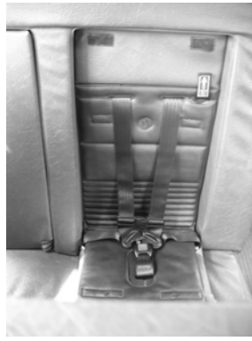
An In-Seat car seat