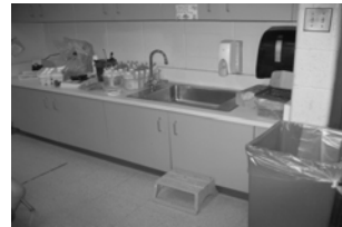
Materials are within reach in art class