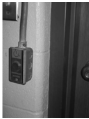
Handicap accessible doors